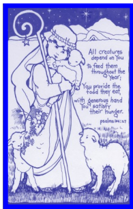
The Lamb of God