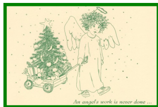
The Littlest Angel