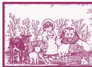
The Little Child of Peace