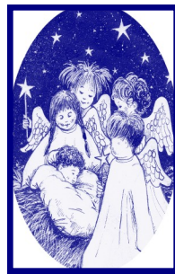
Child of Wonder