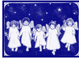
The Gift of Peace