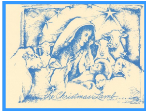
The Christmas Lamb