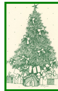
The Christmas Tree

The selling of cards is our only fundraising effort, and enables us to purchase food for our food cupboards and soup kitchens. The extent to which we are able to help those in need depends solely on the generosity and assistance of people like you. With the increase of more and more people in need of food each day, this annual fundraiser is more important than ever.