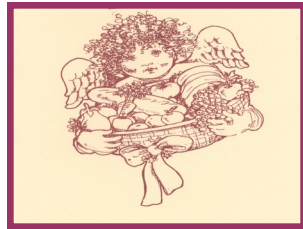
Angel of Bounty