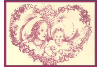
The Heart of Mary